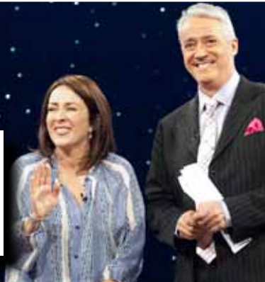
Backstage With... Patty Heaton