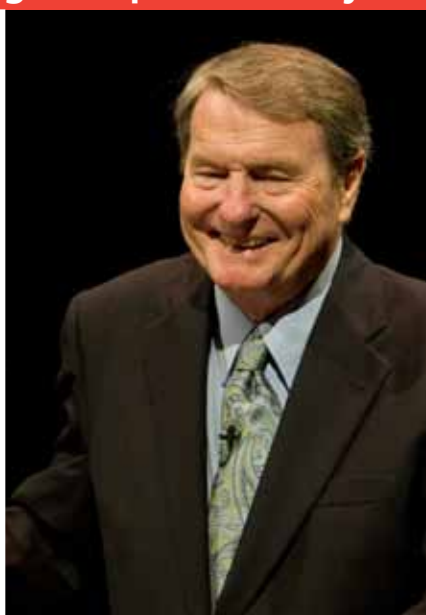
An Evening with Jim Lehrer