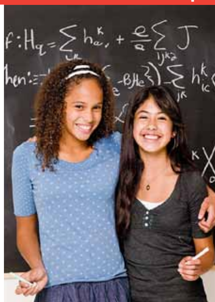
Design Squad Competition