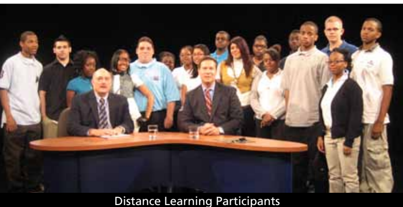
Distance Learning Participants