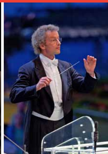
The Cleveland Orchestra in Performance

For a complete list of programs produced by ideastream, visit www.ideastream.org