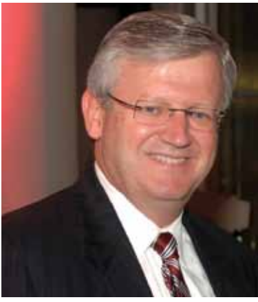
From The Chairman