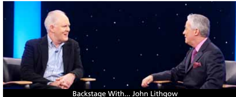
Backstage With... John Lithgow