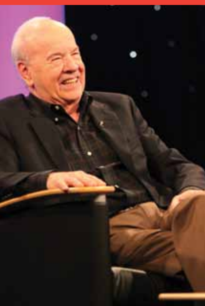
Backstage With... Tim Conway

Read on to learn about some of the programs produced by ideastream in 2010.