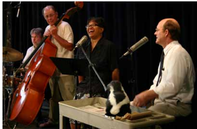
Around Noon: Open Air

The arts take center stage in programming produced by ideastream.