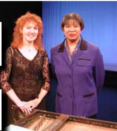
Discovering Vivaldi with Apollo's Fire