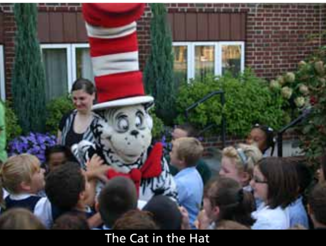
The Cat in the Hat

-Teacher response to ideastream questionnaire